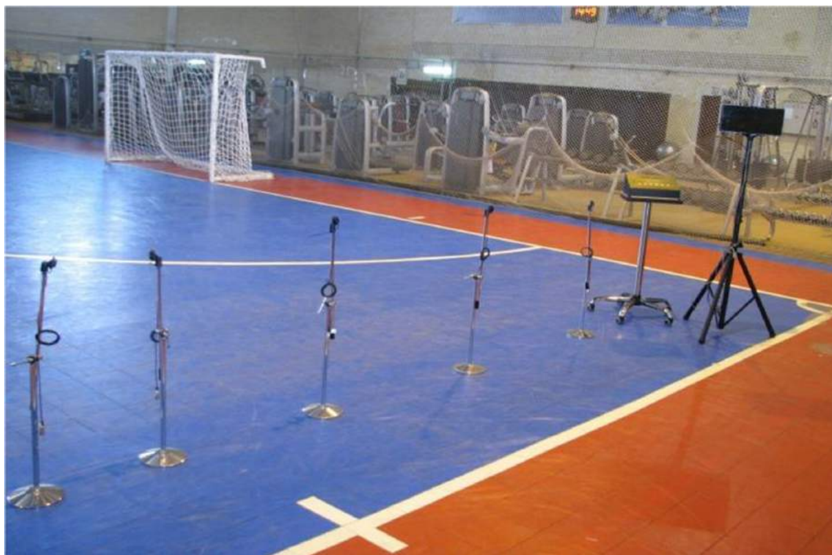
Figure 1. Speed test process

to evaluate the differences between experimental and control group. Intergroup comparison was performed by analysis of covariance. A significance level of P \geq 0.005 was set.