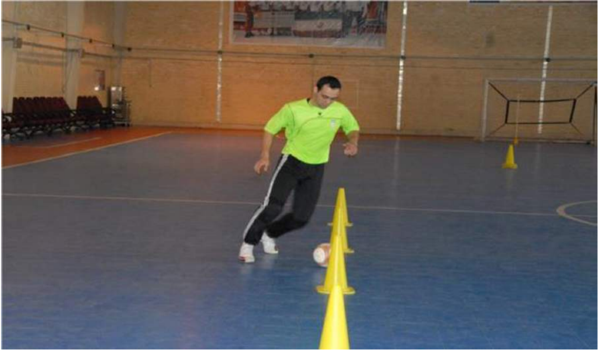
Figure 2. Coordination test process