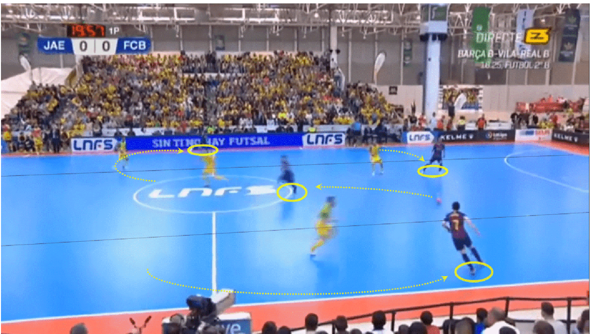
Figure 3. CPT test process