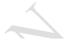
Factors of Auditors' Professional Ethics Immaturity in Iran Based on the Interpretive Structural Approach