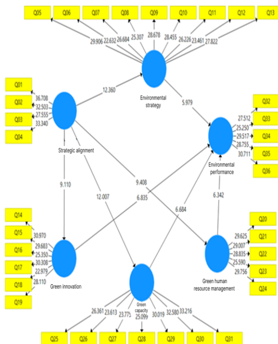
Structural Equation Model with Significance Statistics